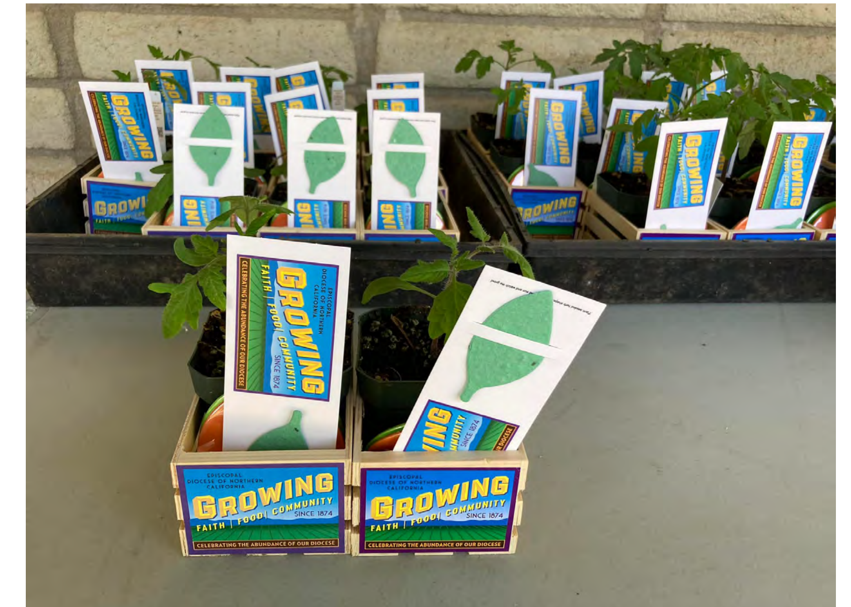
Conference SWAG - Miniature crate with herbs and bookmark