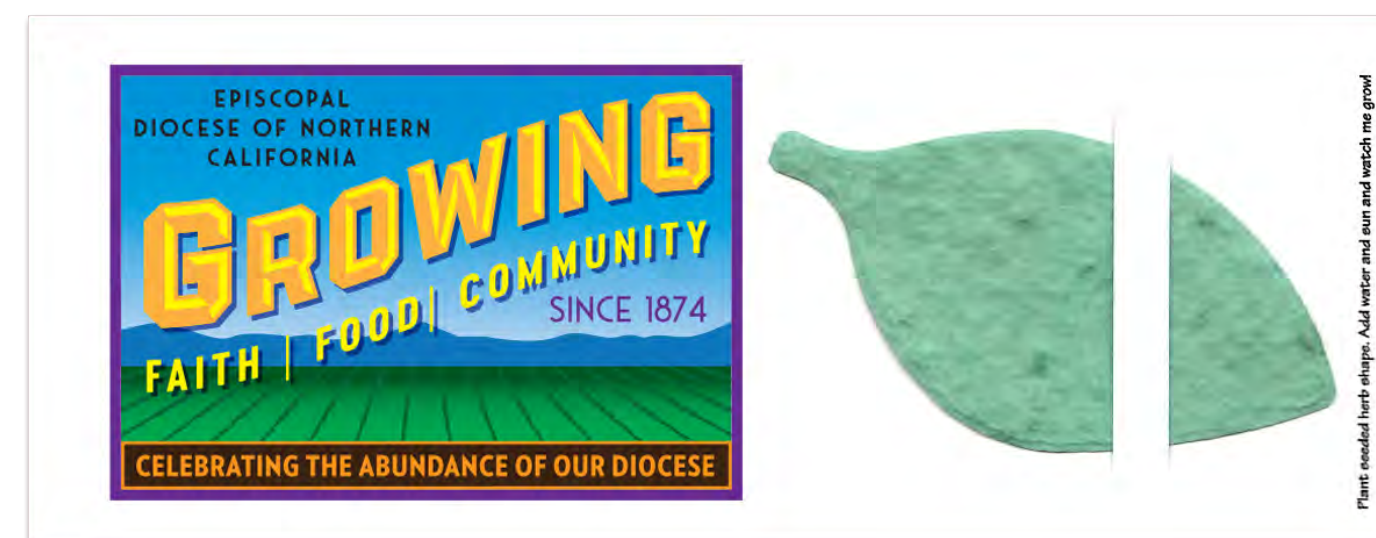
Bookmark with seeds