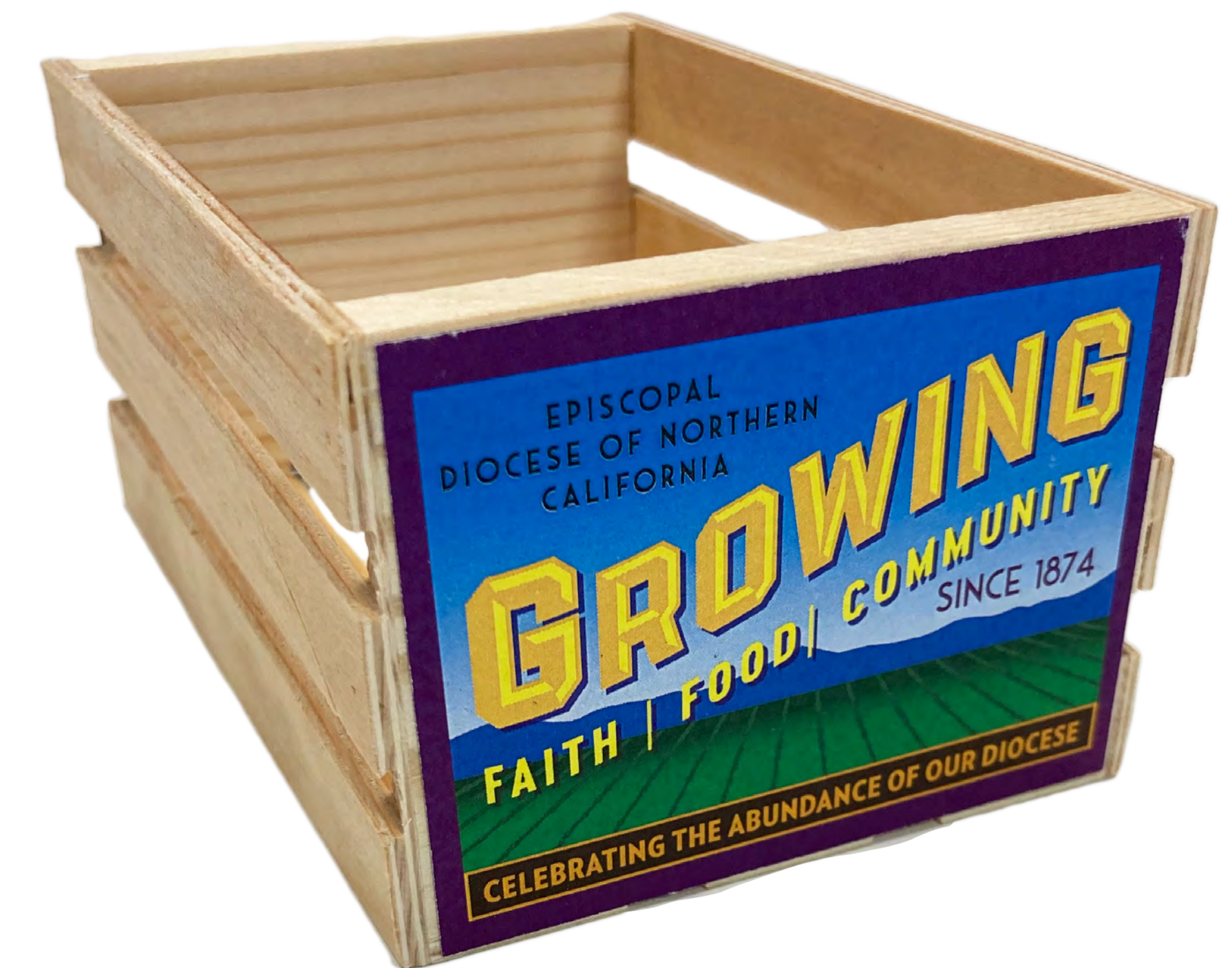
Miniature Fruit Crate